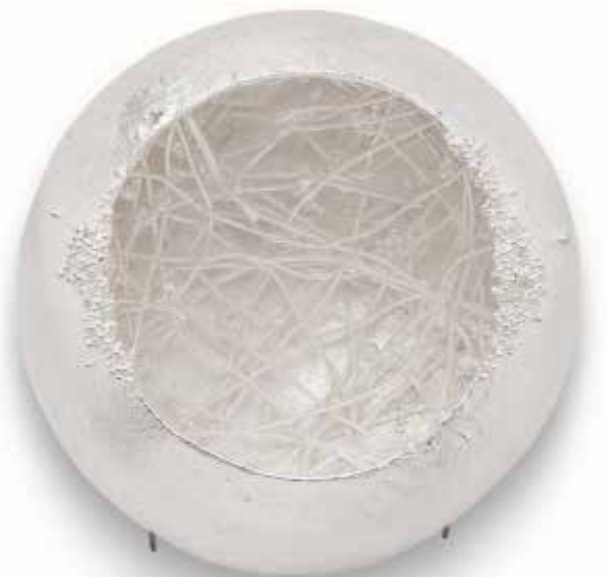
Granular Brooch #4 | 2025