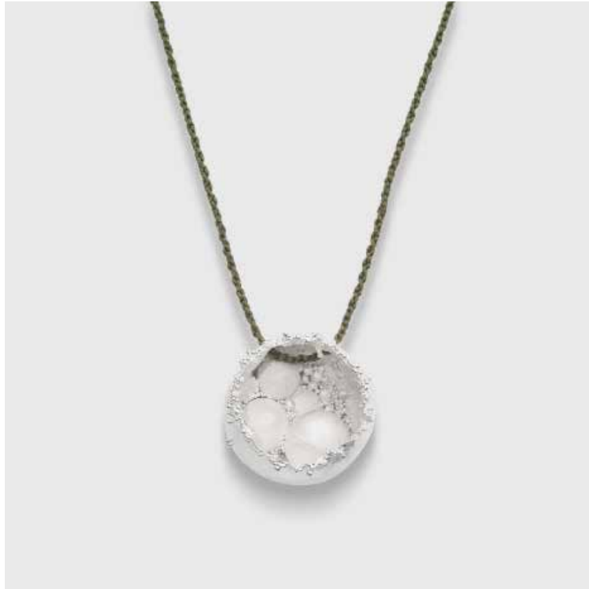
Granular Pendant #2 | 2025