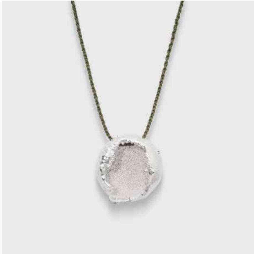
Granular Pendant #1 | 2025