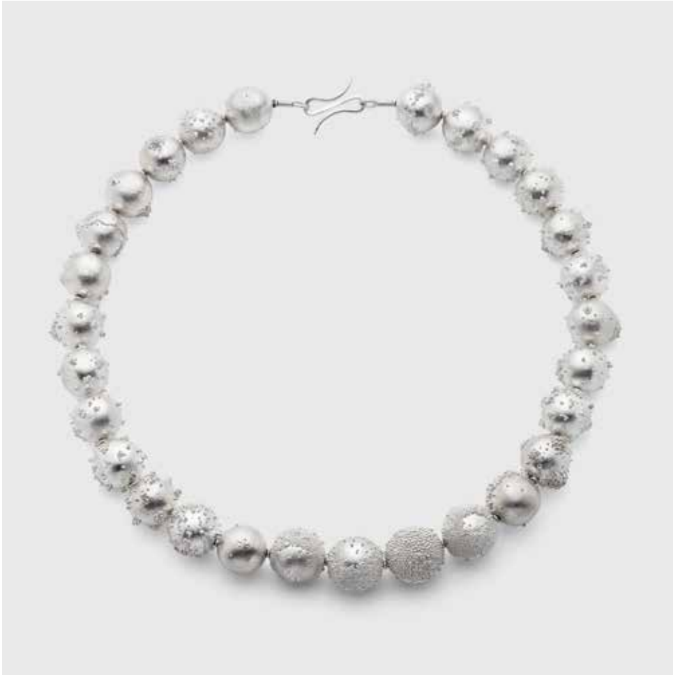
Granulated Necklace | 2025