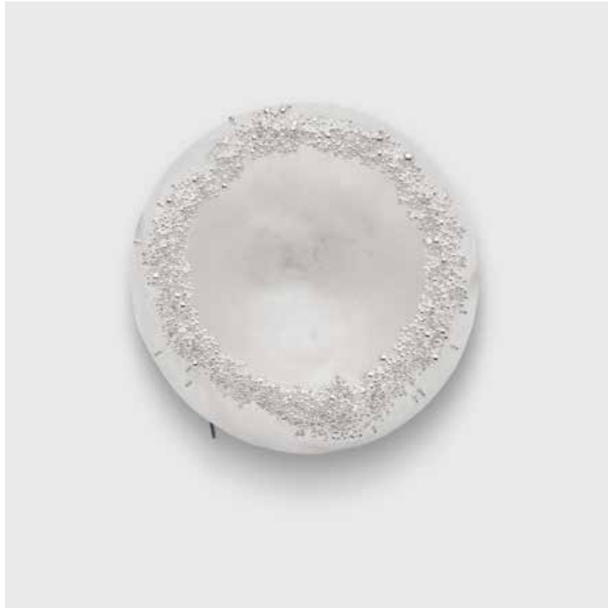
Granular Brooch #2 | 2025