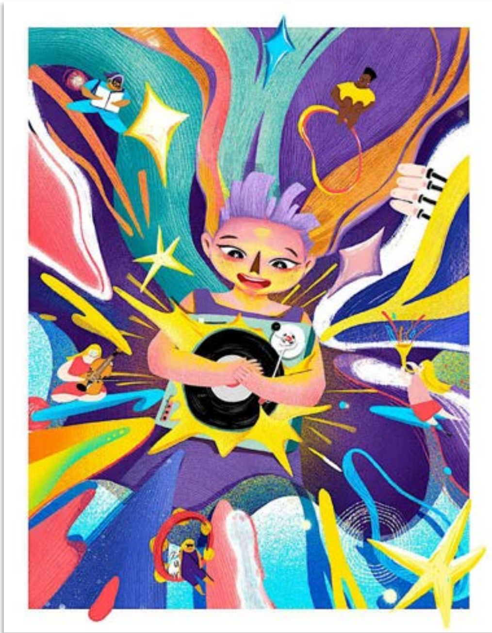
Digital, 154.6mm x 117.5mm

Partnering with Children in Scotland, I've contributed an illustration celebrating the enchanting influence of music on childhood. Using Procreate, I crafted a vibrant scene featuring a young girl with a CD player, symbolizing the boundless joy music brings. Surrounding characters represent the imaginative world music fosters, offering solace and sparking creativity. This illustration highlights music's pivotal role in children's development, promoting a message of optimism and wonder.